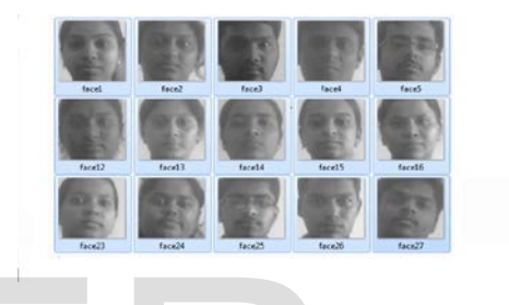
Fig. 3. Images stored in xml database (Trained Faces)

The result of the analysis process is presented here in the form of grayscale images.